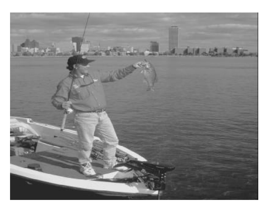
You don't need to venture far from shore (an issue for fishermen with smaller boats) to take advantage of Lake Erie's tremendous smallmouth fishery.

most fertile of all the Great Lakes. Here smallmouth bass enjoy a long growing season, abundant baitfish and crayfish, and ample hardbottom areas where they spawn and feed.