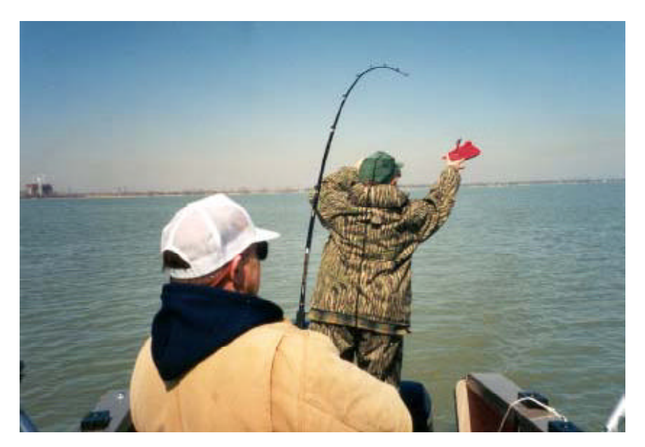
In-line planer boards are important ingredients to any muddywater trolling tactic.

normal fishing technique for Lake Erie is to first locate the fish using my electronics. I often search for hours before even wetting a line. While searching on that day, we managed to find some slightly clearer water several miles out from Breast Bay, but there were no fish inhabiting the cooler water in that area. However, we did mark large schools of bait-fish and large hook shaped icons close to shore and right in the middle of the slop. According to my Lawrance X85, the bait-fish were near the surface and the predatory walleyes were just below them perhaps five or six feet down. The overcast skies and dingy water conditions prompted us to try a modified night-fishing technique. We deployed dark colored, minnow imitating body baits that contrasted with the light brown hue of the water. Minnow imitating body baits like Black/silver and Black/ gold Storm Jr. Thundersticks are