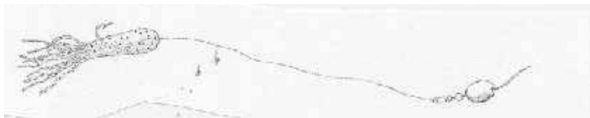
A Carolina rig's heavy sinker makes a bottom commotion that attracts bass to the lure trailing behind.

In the summer," says Hanley, "I see tons of fish on my graph suspended above the bottom, but I've never been able to catch them on lures with any consistency. Now I throw a reaper out over 25 feet of water and drag it behind the