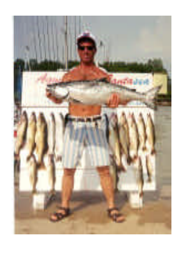
20 pounds and 38 inches