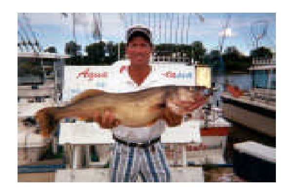
14 pounds and 34 inches