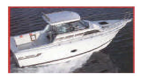
Luxory & Comfort Aboard a 31' Baha Sport Fisherman