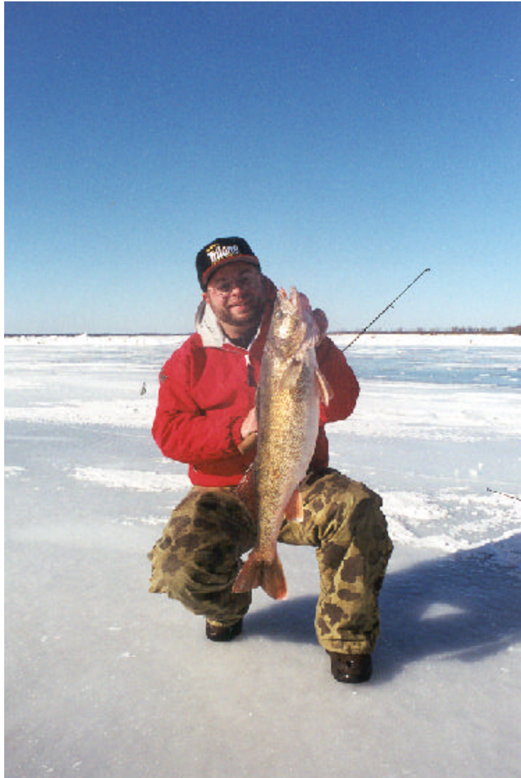
Huge 'Eyes are taken in winter and early spring through the ice or 'around' the ice.

grounds. Come late February and into March, I seek out areas near creeks as well as spawning flats