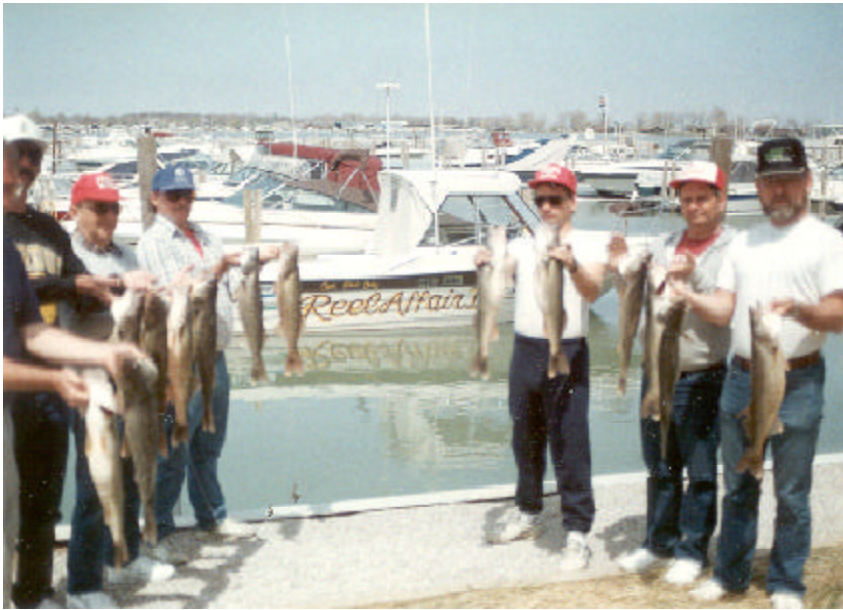
Happy anglers from last year. You can bet these guys will be back for more action in 2002.

October and earlier November which blew out all the water in harbors and bays.