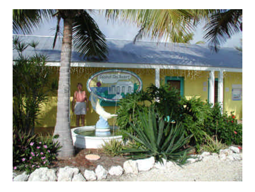
Coconut Cay Resort (above) and the White Sands Inn (below) are both "Fisherman Friendly" and reasonably priced resorts close to area marinas and charter fishing opportunities.

While in the Keys we stayed at two great locations, both of which are 'fisherman friendly' and close to the several Marinas on Marathon. Coconut Cay Resort & Marina is located at mile marker 50.5 and just a few miles east of the 7-mile Marina. Coconut Cay offers the comfort and charm of a Bahamian style resort, quietly tucked away from the busy highway on the bayside of Marathon. Accommodations include 7 waterfront cottages that sleep 6