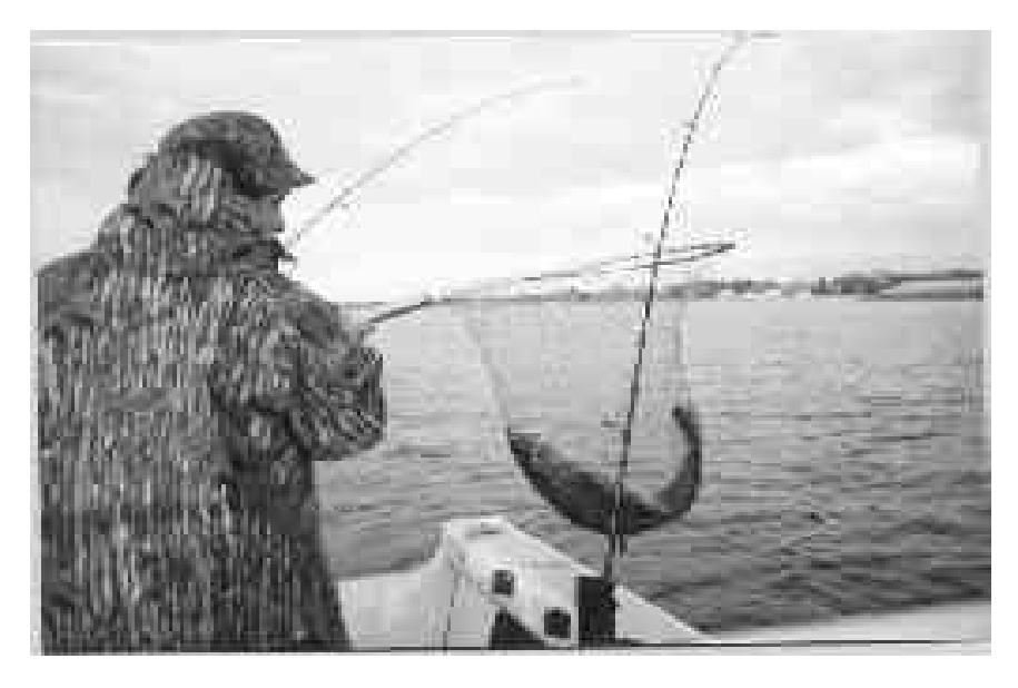
It's routine business landing impressive walleyes during the spring on the western basin of Lake Erie.

quartering along the drop-off making trolling passes most efficient. Since the water was less than ten feet deep, scanning the area with sonar would be pointless. Instead, we set out lines up wind for some in-your-face style scouting. Since the water visibility was rather poor, we opted for subtle action body baits and a rather slow trolling speed. We set out a mix of Storm Jr. Thundersticks in varying colors presenting them behind my Mr. Walleye boards. In-line planer boards are critical to trolling success when targeting walleyes in murky, shallow waters because they present the baits well away from the fish spooking presence of the boat.