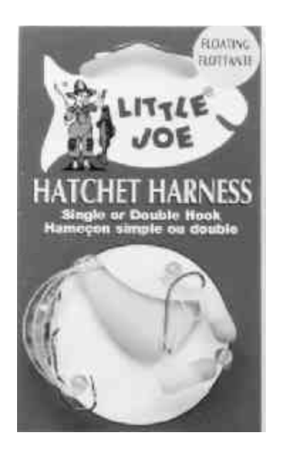
The Hatchet Harness

colors and sizes without having to retie the entire rig. Start with blades in #5s or #7s. Try metallics of gold, silver and bronze when the sun is shining; use florescent colors when it's cloudy or in dingy water.