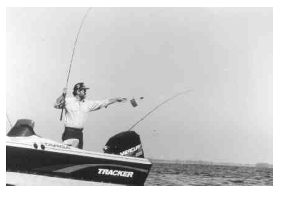
Trolling small planer boards is a very productive way to catch springtime walleyes

important to fishing on Great Lakes waters are GPSs' (Global Positioning Systems). Improved technology and increased "angler demand" have brought the price of these units down dramatically over the past couple of years. A reliable hand-held unit such as the Lowrance GlobalMap 100 offers full GPS mapping capability, 12 channel receiver dependability and easy operation for under $400 ... and it fits in a shirt pocket or can be mounted to the dash of your More permanently boat. mounted units like the GlobalMap 1600 are also available, or even the new LMS 160 Map which combines a state-of-the-art GPS mapping unit with sonar capability. These new Lowrance products have truly brought mapping to a new level, with the ability to allow you to create your own, highly detailed maps of areas you are going to fish. These units come