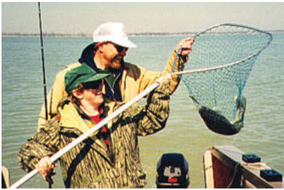
Proper netting technique can put more walleyes in your cooler.

shock and the loosely set drag also keeps the tension constant. Some walleyes will inevitably be hooked by the skin of their lip and this conservative fighting technique will prevent those lightly hooked fish from tearing loose.